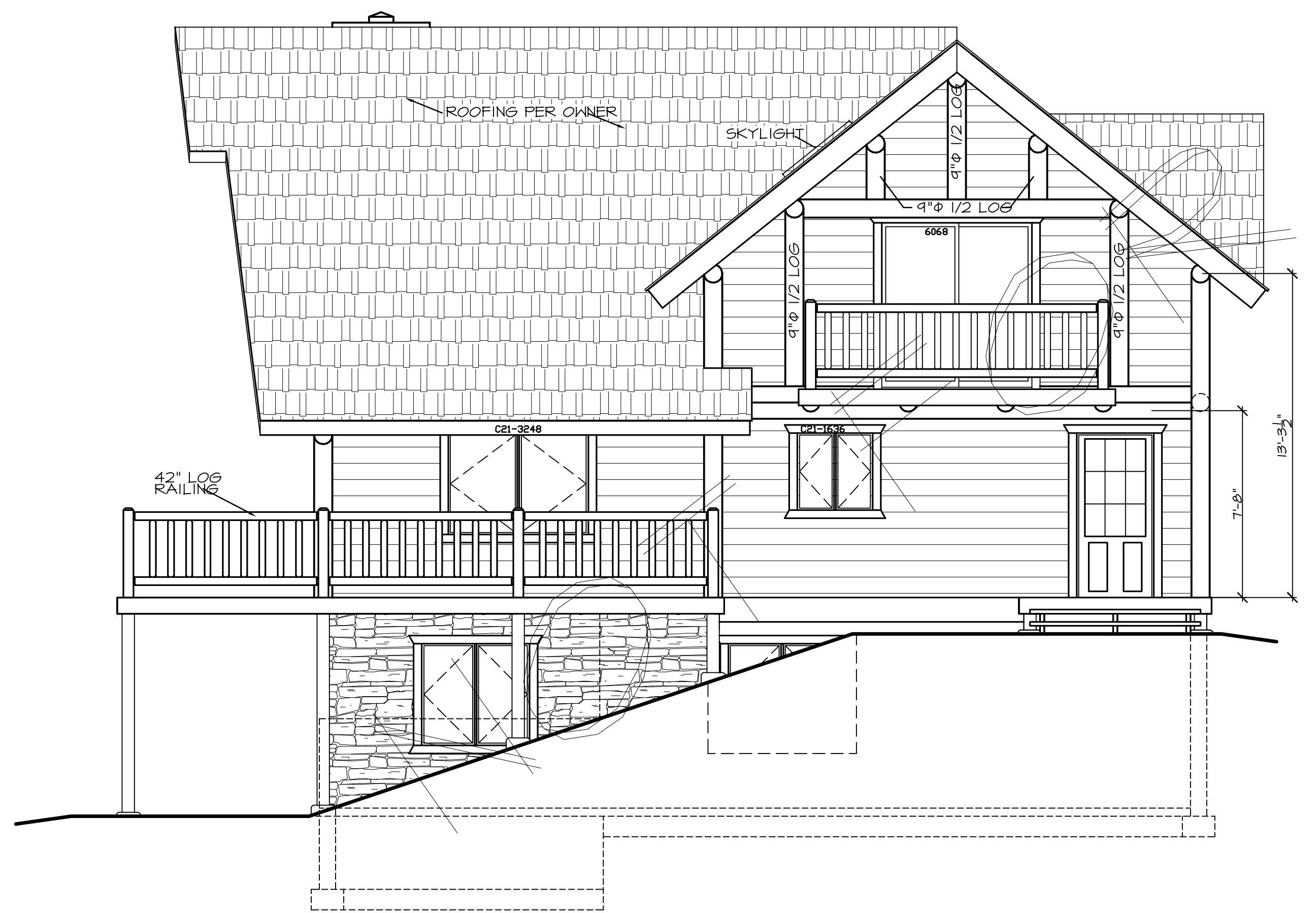
RIGHT ELEVATION SCALE: 1/4" = 1'-0"