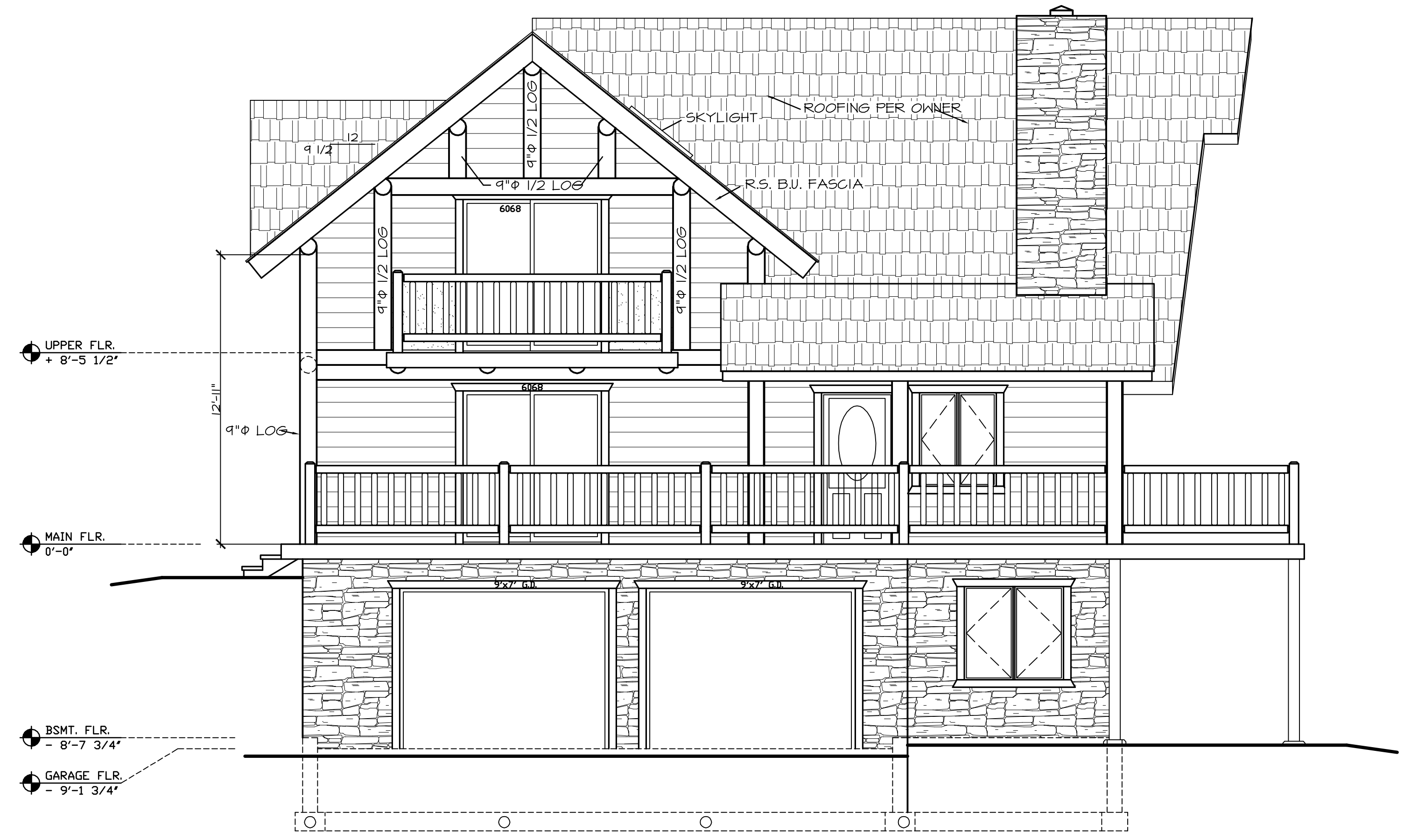
LEFT ELEVATION SCALE: 1/4" = 1'-0"

COPYRIGHTED BY QUICKDRAW DESIGN INC. (QDD). THIS DRAWING IS NOT TO BE USED FOR MAKING ANY REPRODUCTION THEREOF, OR FOR CONTRACTING ANY BUILDING WITHOUT FIRST OBTAINING THE WRITTEN PERMISSION OF THE COPYRIGHT HOLDER, (QDD).