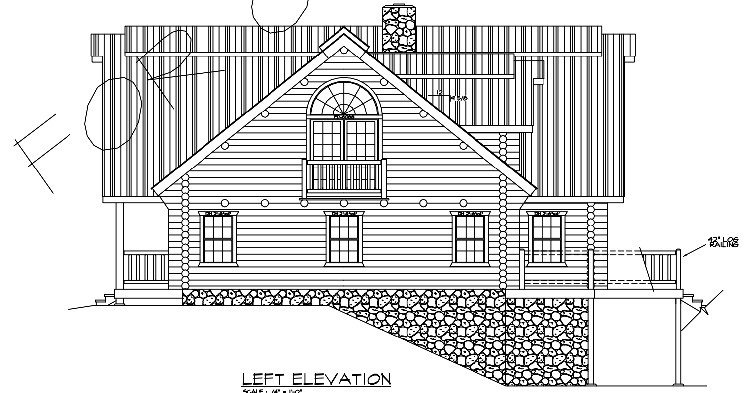
LEFT ELEVATION SCALE: 1/4" = 1'-0"