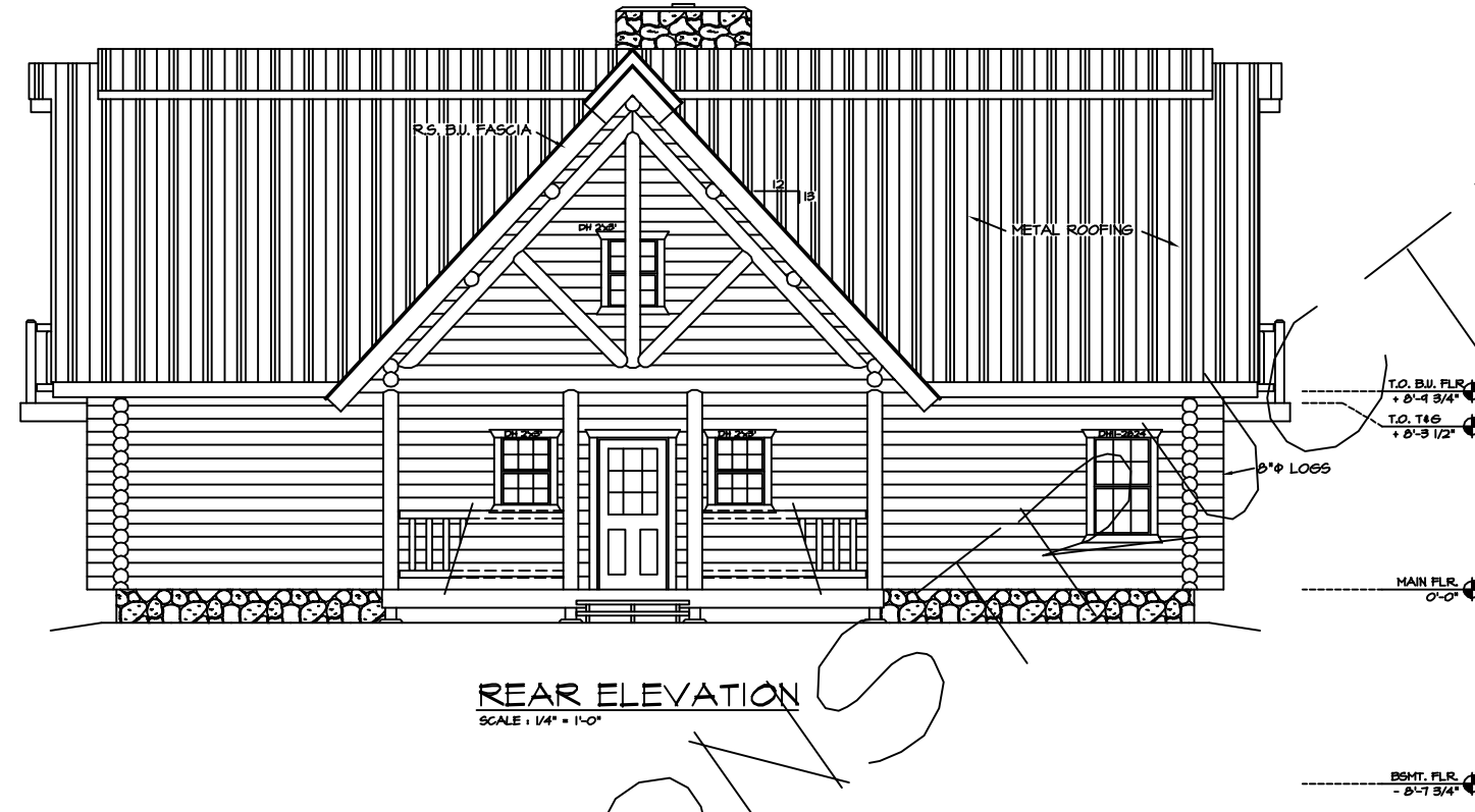
REAR ELEVATION SCALE: 1/4" = 1'-0"

REFER ANY QUESTIONS OR DISCREPANCIES TO QDD BEFORE START OF CONSTRUCTION.