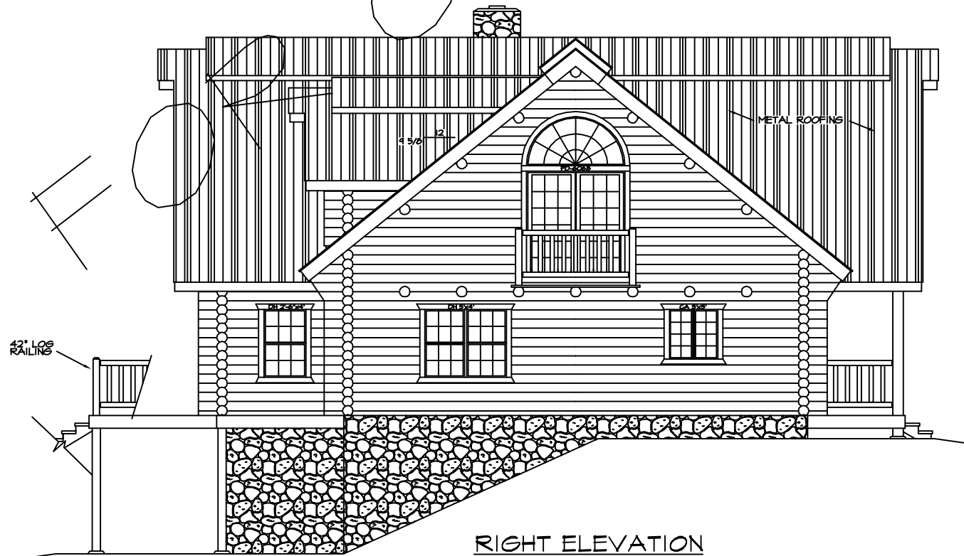
RIGHT ELEVATION SCALE: 1/4" = 1'-0"