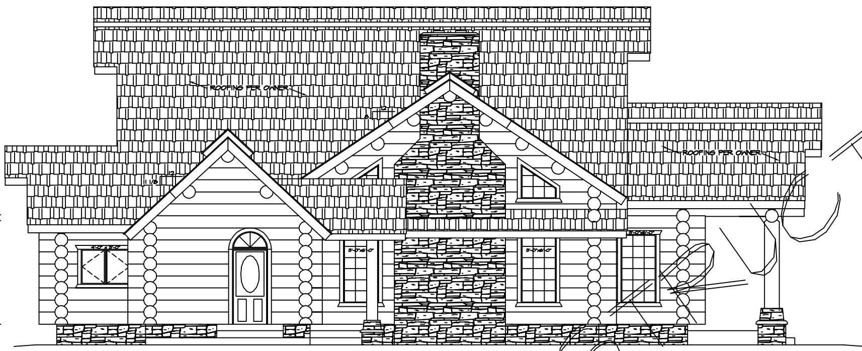
LEFT ELEVATION SCALE: 1/4" = 1'-0"

TOP OF 2nd BUILT UP FLR = 9'-10 1/4" TOP OF T&G = 9'-4" MAIN FLR = 0'-0" BGMT. FLR = -10'-0 1/4"