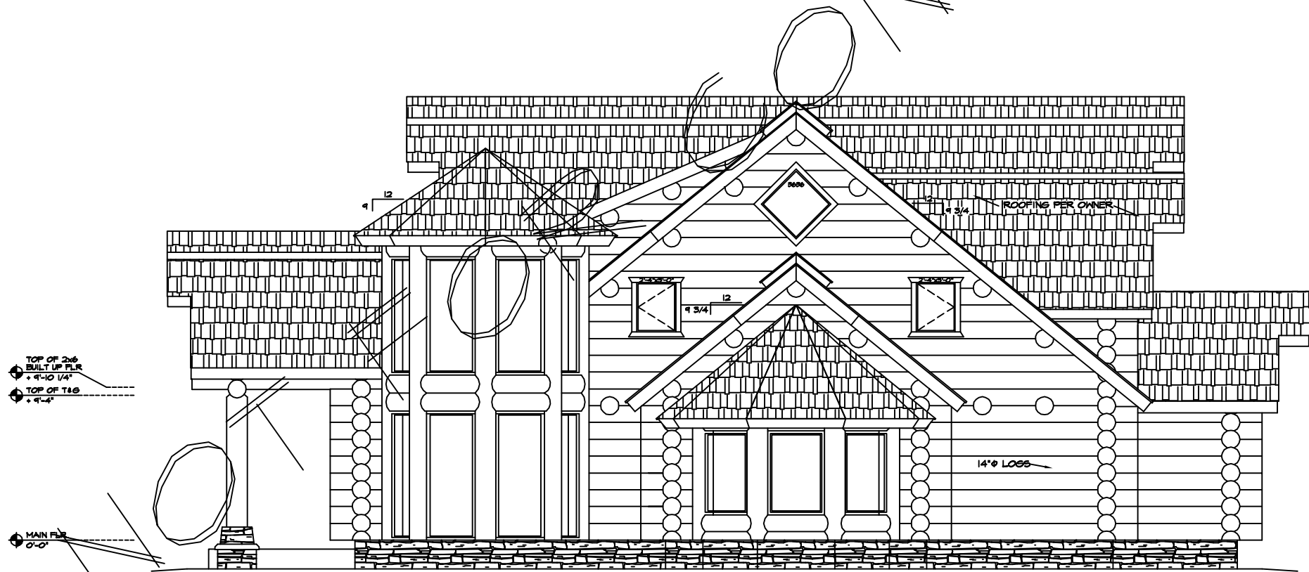
RIGHT SIDE ELEVATION SCALE: 1/4" = 1'-0"

TOP OF 2ND BUILT UP FLR + 9'-10 1/4" TOP OF 1ST B + 9'-4"