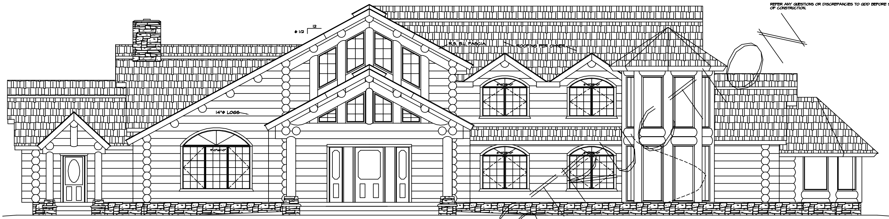
FRONT ELEVATION SCALE: 1/4" = 1'-0"

COPYRIGHTED BY QUICKDRAW DRAFTING. THIS DRAWING IS NOT TO BE USED FOR MAKING ANY REPRODUCTION THEREOF OR FOR CONTRACTING ANY BUILDING WITHOUT FIRST OBTAINING THE WRITTEN PERMISSION OF THE COPYRIGHT HOLDER, QUICKDRAW DESIGN & DRAFTING (QDD). DO NOT SCALE DRAWINGS. QDD IS NOT RESPONSIBLE FOR ERRORS DUE TO SCALED DRAWINGS. REFER ANY QUESTIONS OR DISCREPANCIES TO QDD BEFORE START OF CONSTRUCTION.