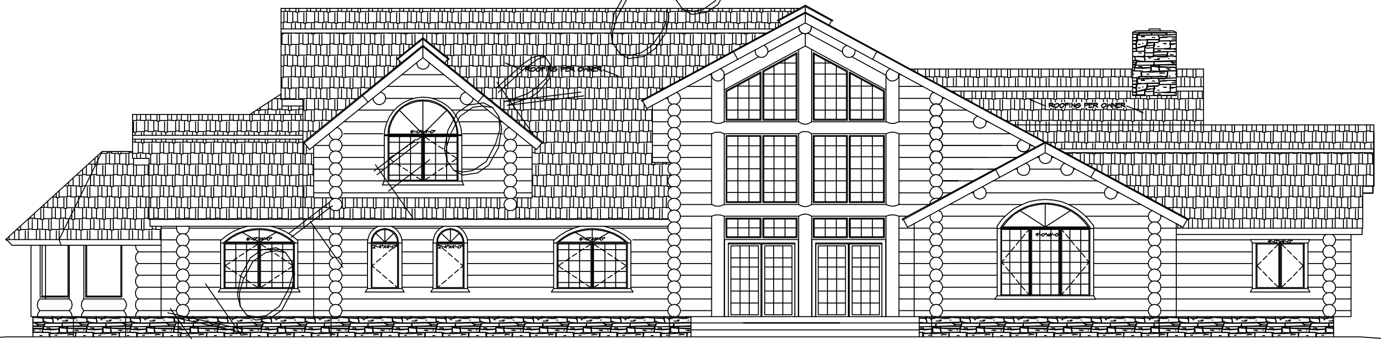
REAR ELEVATION SCALE: 1/4" = 1'-0"

NOTE: EVERY EFFORT HAS BEEN MADE TO ASSURE THE ACCURACY OF DIMENSIONS AND DETAILS, HOWEVER, IT IS THE RESPONSIBILITY OF THE BUILDER TO VERIFY ALL MEASUREMENTS.